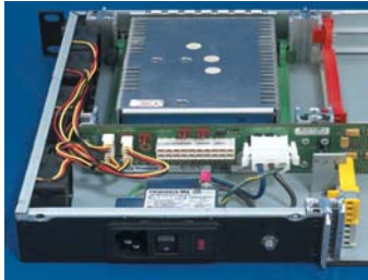
Power Input Module