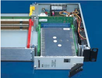
Power Supply Unit 175 W, hot swap-compatible, Order No. see page 90. Note: For open frame or ATX power supply solutions, please contact factory