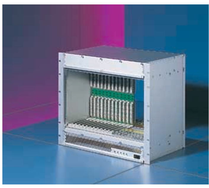
Ripac Rack-Mounted System For CompactPCI 9U (6 + 1 \times 1.5), 8 slots, with RiCool radial fan.

A 9U x 84HP integrated subrack that accepts up to fourteen 6U, 64 or 32-bit CompactPCI boards and up to two double-wide (8HP) 6U-power supplies to form a complete CompactPCI system.